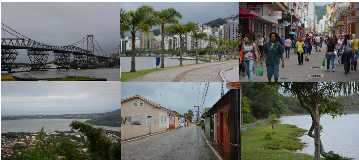
Florianópolis, Santa Catarina, Brazil, where Federal University of Santa Catarina is located