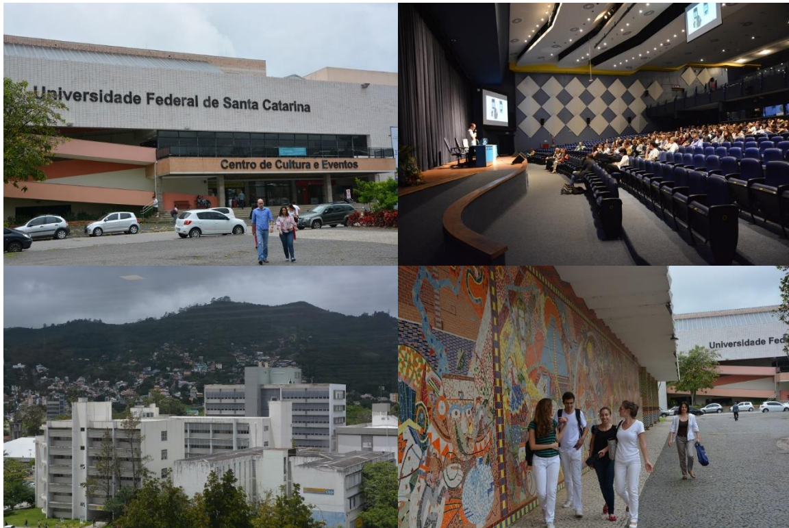
Federal University of Santa Catarina, the venue of the 18 th World Congress in 2018